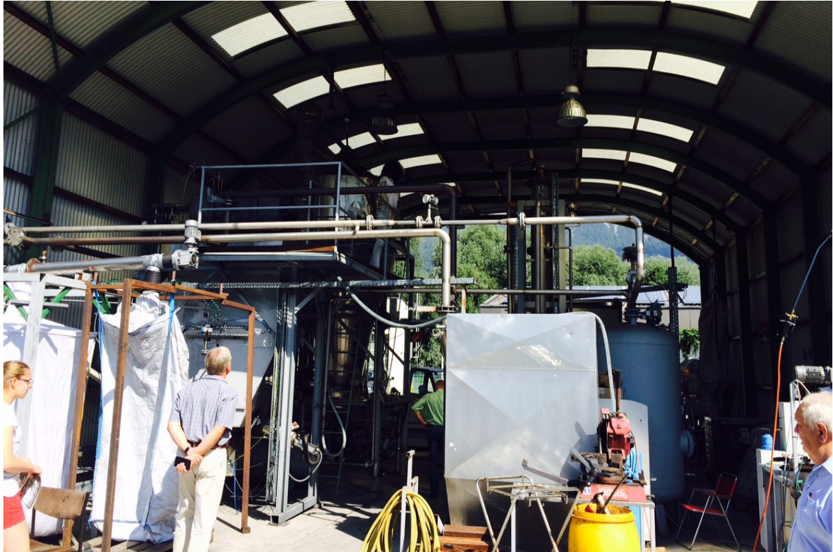
Figure 6: Wood gasifier at Schwaz