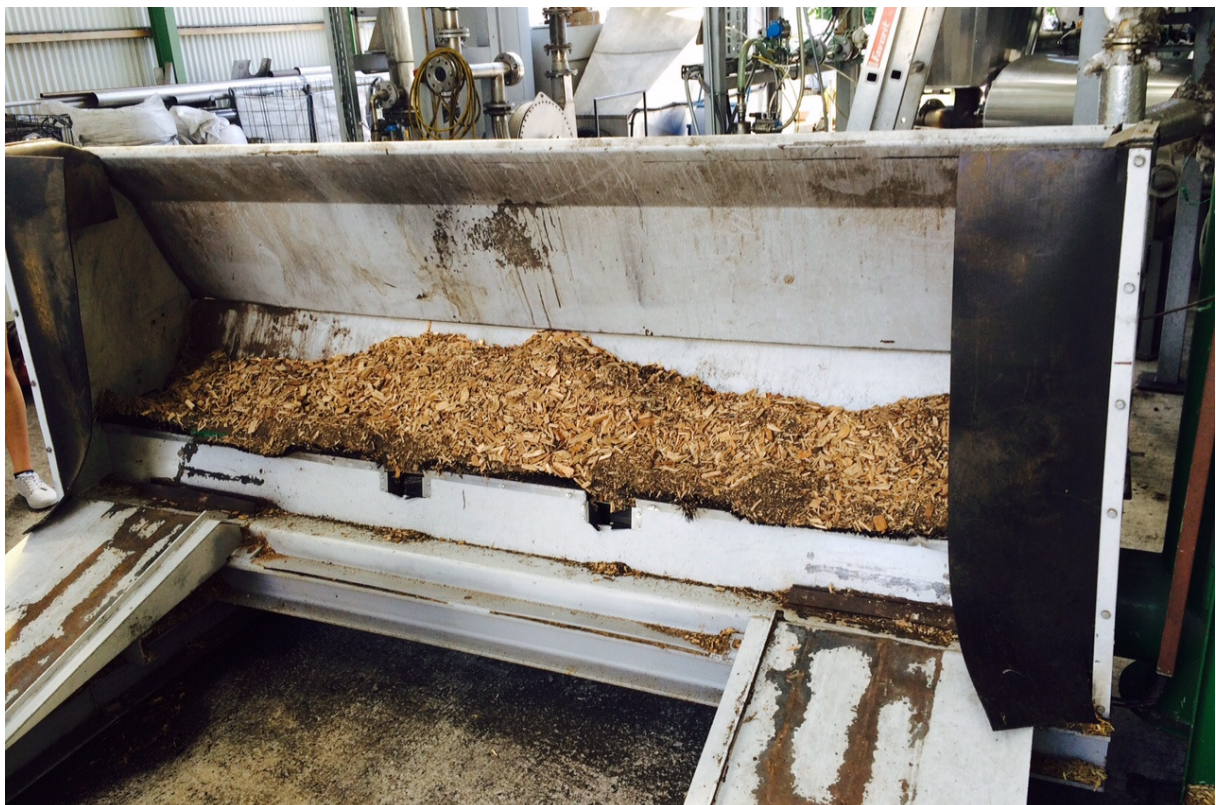
Figure 7: SRC woodchips used in the wood gasifier at Schwaz