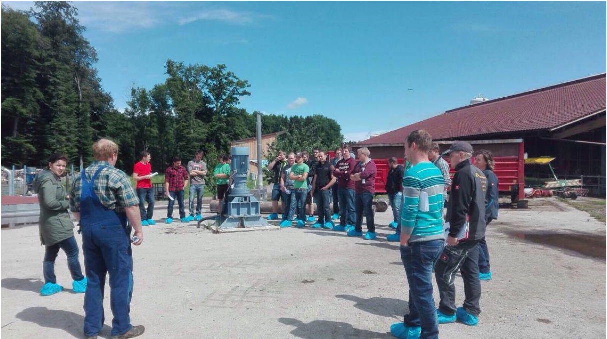
Figure 10: Drying container (rec container in the back of the participants) for wood chips at the site of the biogas plant.