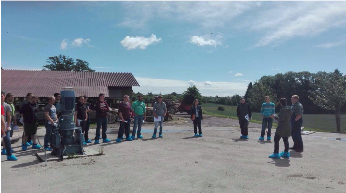
Figure 9: Welcoming at the Biogas plant