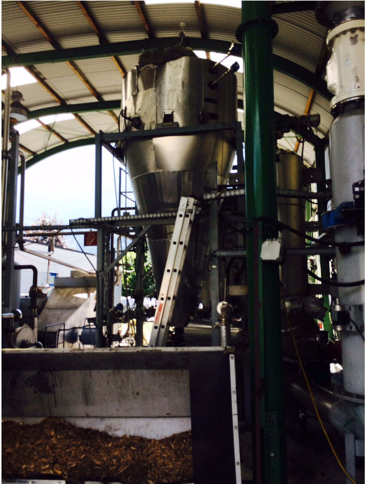
Figure 8: Wood gasifier at Schwaz (2)