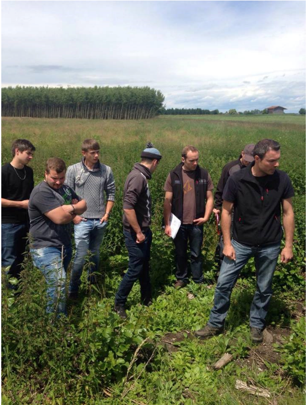
Figure 11: Participants at the SRC plantation at Übersee