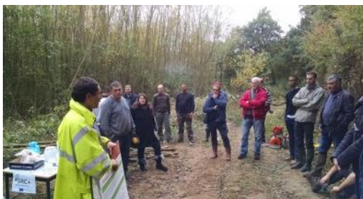
Figure 17: SRC as erosion barrier

New opportunities are being tested to diversify the uses of SRC. For instance, the region of Normandy is facing some high erosion problem where SRC stems are being used to tackle the erosion problems. Besides, a NEW Interregional project, RE-DIRECT, coordinated by the University of Kassel will test biochar and active carbon production (as amendment, feeding additive, water filter) from residual biomass of SRC woody plantations.