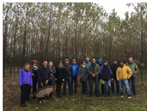
Figure 2: SRCplus consortium in the Uherský Brod – Bánov region, CZ.

Within the study tour, the consortium visited the area of Uherský Brod – Bánov which was assessed as a potential area for growing SRC at the beginning of the project. The area is situated in a slightly warm climate region, slightly muggy. It has an annual precipitation of 594 mm, and in the growing season it is about 366 mm. The average annual temperature is 9.1°C. Its predominant soils are medium creditworthiness, clay and till, in the vicinity of watercourses are alluvial soils, and there are approximately 22 000 inhabitants in the area. This is the first time the consortium visited the region to witness the SRC development of the area. The results were more than satisfactory.