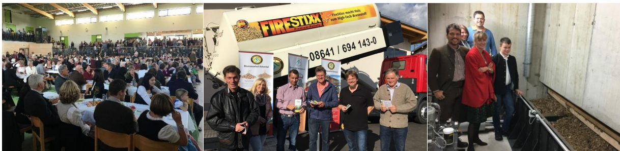
Figure 4: Impressions from the training event in Rimsting

In October 2016, two successful training events took place in the region of Achental: Both trainings were dedicated to users and traders of wood chips. The first one combined the inauguration of the new heating plant in Rimsting, which can easily use SRC wood chips as biofuel: