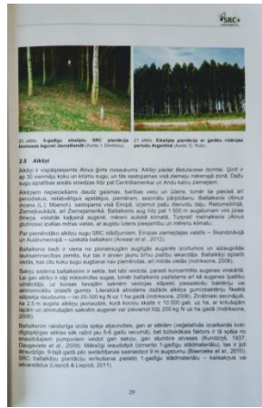
Figure 12: Latvian SRCplus Handbook