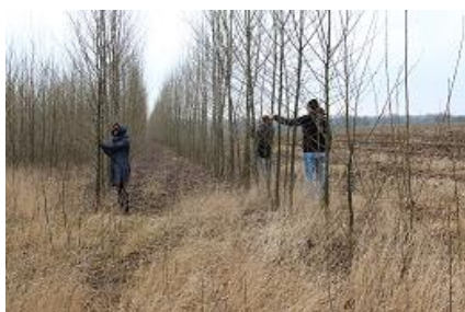
Figure 6: SRC plantation in Zlín

The SRCplus project is coming to an end and show the success in the Zlín Region. The letters of commitment are about to be signed. More than 200 farmers, public land owners and users of wood chips attended the seminars, and the Energy agency of the Zlín Region established cooperation with many of them. Outputs like the SRC handbook and flyers were distributed during the seminars and supported the capacity building events. The SRCplus