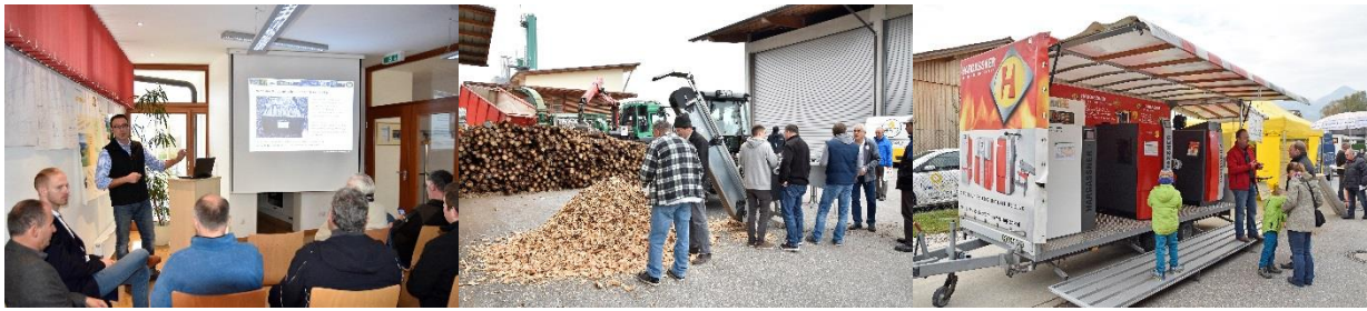
Figure 5: Impressions of the second WP5-training event in Grassau

Both training events were successful. The number of participants exceeded the expectations of the initiators by far: over 150 participants signed the participation list, but many more people attended; which can be seen in Figure 4.