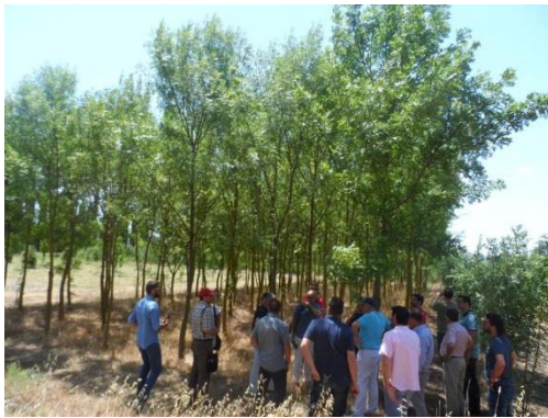
Figure 13: First training for public landowners in Greece

existing small-scale biomass heating applications and medium-large scale heat production from woodchips.