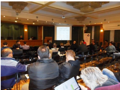
Figure 14: Training seminar for public land manager in Kerkini, Grece

Three SRCplus events were organised in the prefecture of Serres from 29 th November to 1 st December 2017. The first event was organised on November 29 th as a training seminar for public land managers, held in the area of the protected area of the lake Kerkini. The local authority responsible for the management of the lake supported the event. Speakers presented the benefits of the production and use of woodchips from SRC in the area as well as environmental benefits of cultivating forest species around water bodies (minimizing leaching of nutrients due to intensive agriculture).