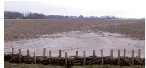
Figure 16: Site visit, Saint Gilles SRC plantation

At a farm level, SRC production can be included in strategies for food and/or energetic independency. Some dairy farmers want to improve their feed autonomy, replacing corn and soybean with grass. Drying grass in farms is part of the task. Farmers are interested in developing an SRC production to feed the boilers.