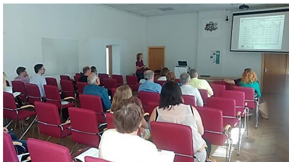
Figure 7: Seminar in Vidzeme

The 2 nd seminar for public land owners took place in Madona (Vidzeme region) on 31 st of May 2016. The topics covered during the seminar included benefits of SRC practices, SRC related legislation, good practice examples and potential for SRC plantations in the region. An external expert from the Institute of Agricultural Resources and Economics has been subcontracted in order to identify suitable areas for SRC production in Vidzeme planning region. The results and the economic analysis for the SRC cultivation were presented by the experts.