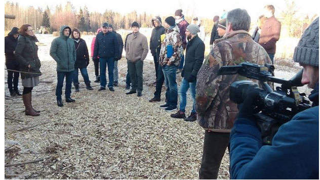
Figure 9: Participants at the Vidzeme workshop