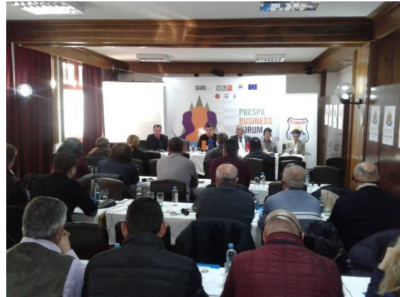
Figure 18: National Workshop in Macedonia

At the beginning of December 2016, a national workshop took place in order to share the experiences and outcomes of the project to relevant stakeholders. Farmers, companies, agro associations, authorities from several regions, and others discussed the opportunities and potentials for a further cooperation. This cooperation is leading to strengthen the supply chains.