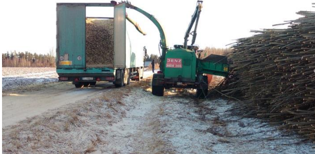
Figure 8: Wood-chipping site

contribution of the film crew was broadcasted on 26 th January 2017 within the regional news and the broadcast can be found also found on the home page of the Transmitter company - http://vtv.retvlv/vidzemes-zinas-zemkopibas-ministrs-darba-vizite-viesojas-rujienas-un-nauksenu-novada-saimniecibas/ (in Latvian, material about SRC starts at 10:10).