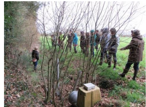
Figure 15 How coupling buffer strips with biomass crops? Site visit during the ATBVB regional workshop

In Brittany, most of the kick-off activities for the SRCplus project focused on the water protection topic. For instance, the regional workshop of SRCplus involved organisations working closely on watershed protection; the round tables involved research institutes, regional and local authorities, and water supply agencies. The national conference was organised with assistance of the advisory organisations working on water management and water protection.