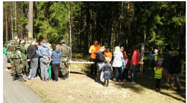
Figure 10 and 11: Presentation at the local forest fairs

The handbook was translated and has been distributed during the training seminars, sent to the local libraries, and copies are available at the Latvian University of Agriculture, Liepāja University and JS “Latvian state forests”. The books are free of charge and available at the LFR I Silava library. The handbook has been distributed in cooperation with the forest owner NGO, and “Selected willow growers association”.