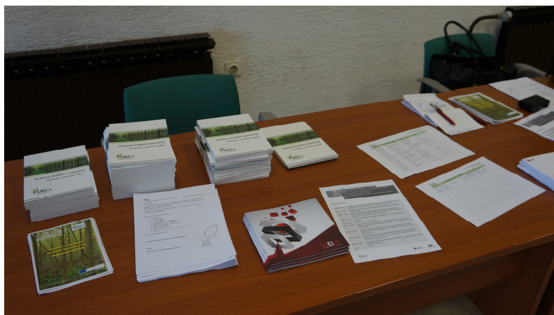
Figure 11: Project material available for participants (handbook, flyer for farmers, flyer for woodchip users, agenda)

For the preparation of the seminars, mostly materials developed within SRC plus were used, but as well materials from other projects. The seminar was a great opportunity to present the handbook and distribute it among participants.