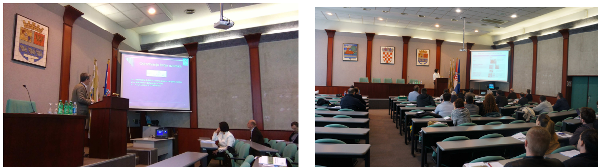
Figure 5: Mr. Prskalo (Euroinspekt- drvokontrola) and Mrs. Trkmić (HEP- Proizvodnja)

Centrometal is a major boiler producer from Croatia that previously worked with DN52731, but today they use DIN plus and ENplus A1 norms. A1 and A2 quality are required for smaller boilers while B1 and B2 are required for industrial boilers. Mr. Grđan presented many examples how wood chips and pellets are used in concrete examples in Croatia. He emphasised that the amount of ash is quite a significant parameter, since it determinates how much time will be needed for weekly boiler maintenance (including ash removal). Most of the clients are more in favour of pellets than woodchips even though woodchips are cheaper. Pellets are easier to handle and it is easier to secure their supply: you can buy pellets today even in supermarkets, while woodchips you have to order by truck. The position and available space for biomass storage is one of the main things to consider in the planning process. Pellets need three times less space in relation to woodchip (of same heating value). Since availability of space for boiler is often a problem, container boilers are interesting solution that can be mounted outside buildings. This system allows the coexistence of two systems, the old one and the new one on biomass. The old system can serve as a backup.