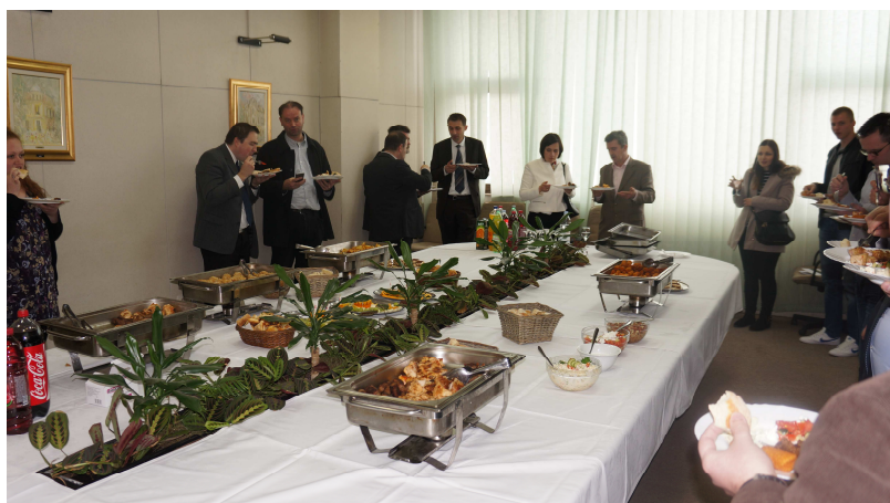
Figure 10: Lunch and networking

During the seminar one coffee break was organised. Seminar was concluded with lunch for the participants and opportunity for networking, exchange of experience and development of ideas for business collaboration.