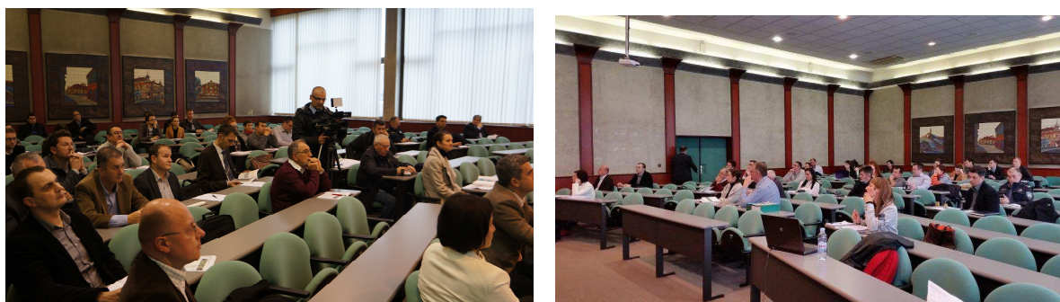
Figure 1: Seminar participants and venue

The participants were introduced to the project and available project materials. Furthermore, they were informed about basic characteristics of SRC cultivation (species, agro technical measures), possibilities of sustainable SRC development within the county, potential for usage of woodchip from SRC and obstacles in SRC development and SRC woodchip use. Sustainable agricultural practices for wood chips production from SRC were also promoted in order to highlight environmental benefits of SRC. However, the focus of the seminar was on examples and questions on how biomass can be more used, especially from SRC. This is done in order to create new biomass users that will consider SRC as potential biomass source. The last part of the seminar was organised in form of discussions between the participants and the focus shifted from information provision to active involvement of participants in discussion.