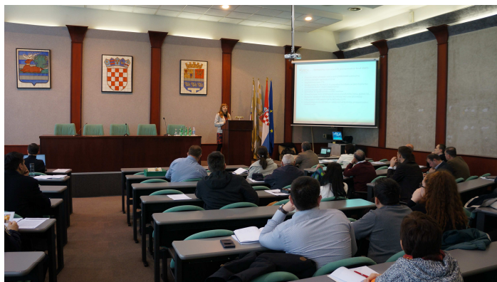
Figure 4: Ms. Fištrek (EIHP)

Ms. Fištrek (EIHP) presented SRCplus project, the project objectives, activities and results so far, followed by the general presentation on SRC with focus on species, legislation, and sustainability issues and SRC. The business models were presented as well as successful examples of SRC production and local SRC woodchip consumption. Further on, she presented experiences from countries with advanced SRC market, and possibility of development of local supply chains from perspective of heat consumption within the country.