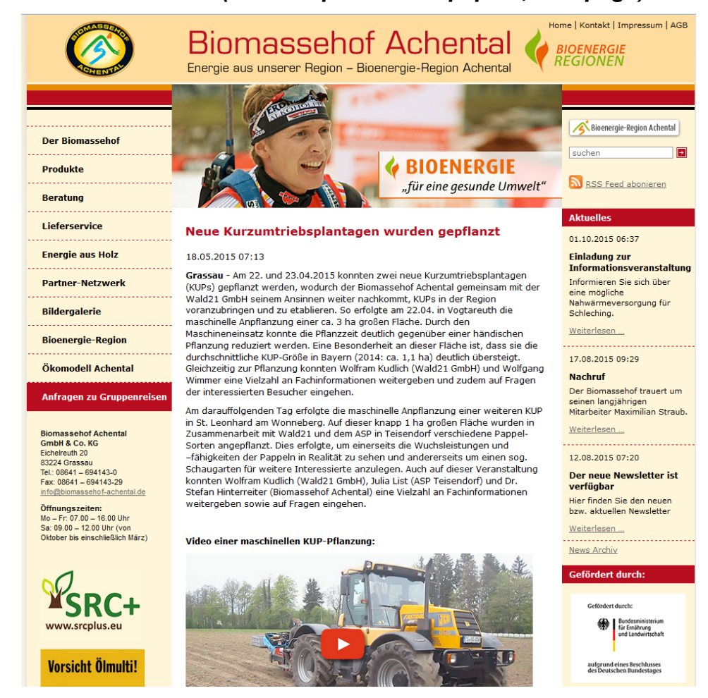
Figure 7: Article of the first training event, published at the homepage of the Biomass Trading Centre (see <a href="http://www.biomassehof-achental.de/news/items/neue-kurzumtriebsplantagen-wurden-gepflanzt.html">http://www.biomassehof-achental.de/news/items/neue-kurzumtriebsplantagen-wurden-gepflanzt.html</a>)