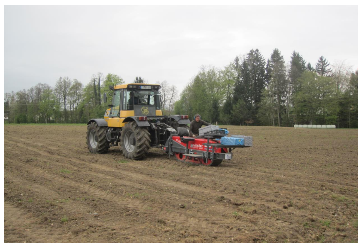
Figure 5: Planting machine "in action" at the new SRC site in St. Leonhard (1)