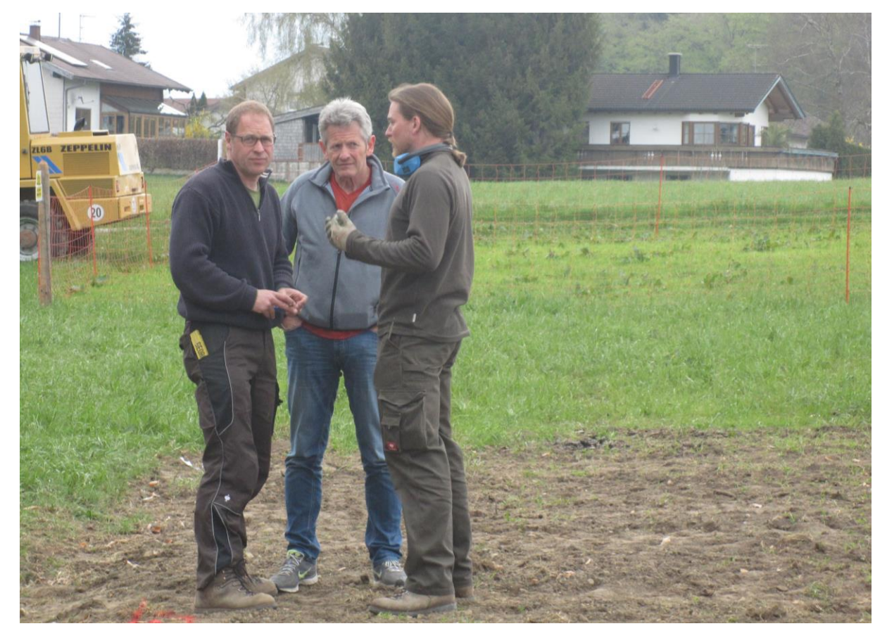
Figure 4: Discussion at the training events between the participants