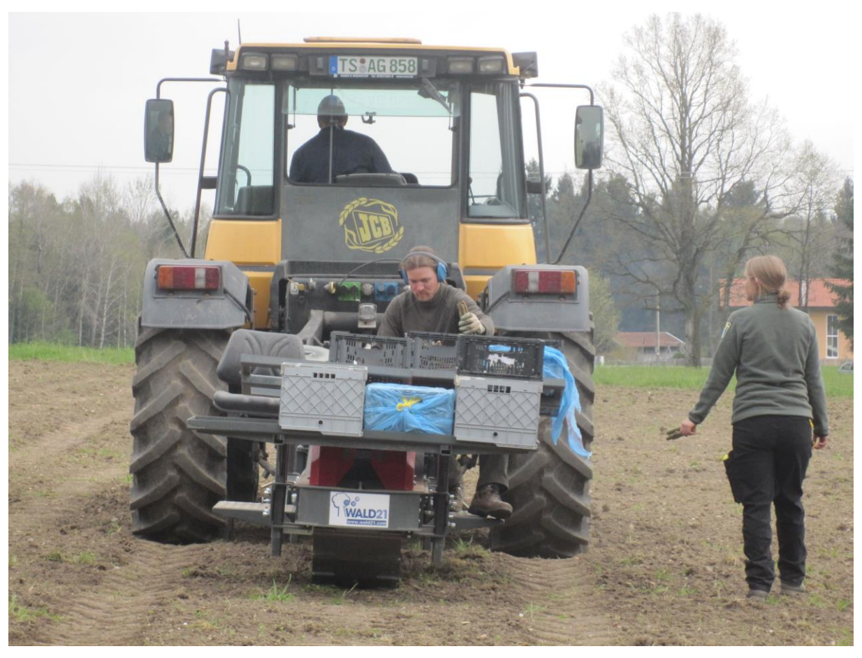
Figure 6: Planting machine "in action" at the new SRC site in St. Leonhard (2)