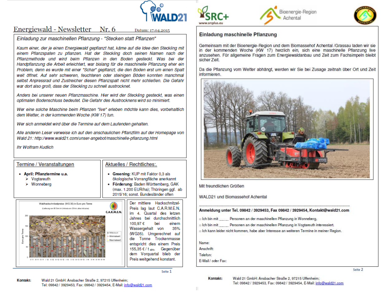
Figure 2: Invitation to the event (see <a href="http://www.biomassehof-achental.de/tl_files/images/bioenergie_region/pressetexte/Einladung%20maschnielle%20Pflanzung_klein.pdf">http://www.biomassehof-achental.de/tl_files/images/bioenergie_region/pressetexte/Einladung%20maschnielle%20Pflanzung_klein.pdf</a>)