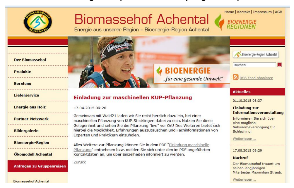
Figure 1: Invitation to the first training events, published on the homepage of the Biomass Trading Centre (see <a href="http://www.biomassehof-achental.de/news/items/einladung-zur-maschinellen-kup-pflanzung.html">http://www.biomassehof-achental.de/news/items/einladung-zur-maschinellen-kup-pflanzung.html</a>)