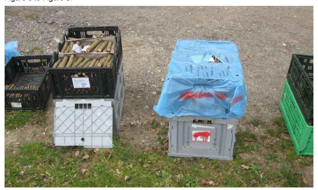
Figure 3: Different SRC-species used for the new SRC plantations

In the following chapter, several photos taken at the event in St. Leonhard are shown in Figure 3 to Figure 6.