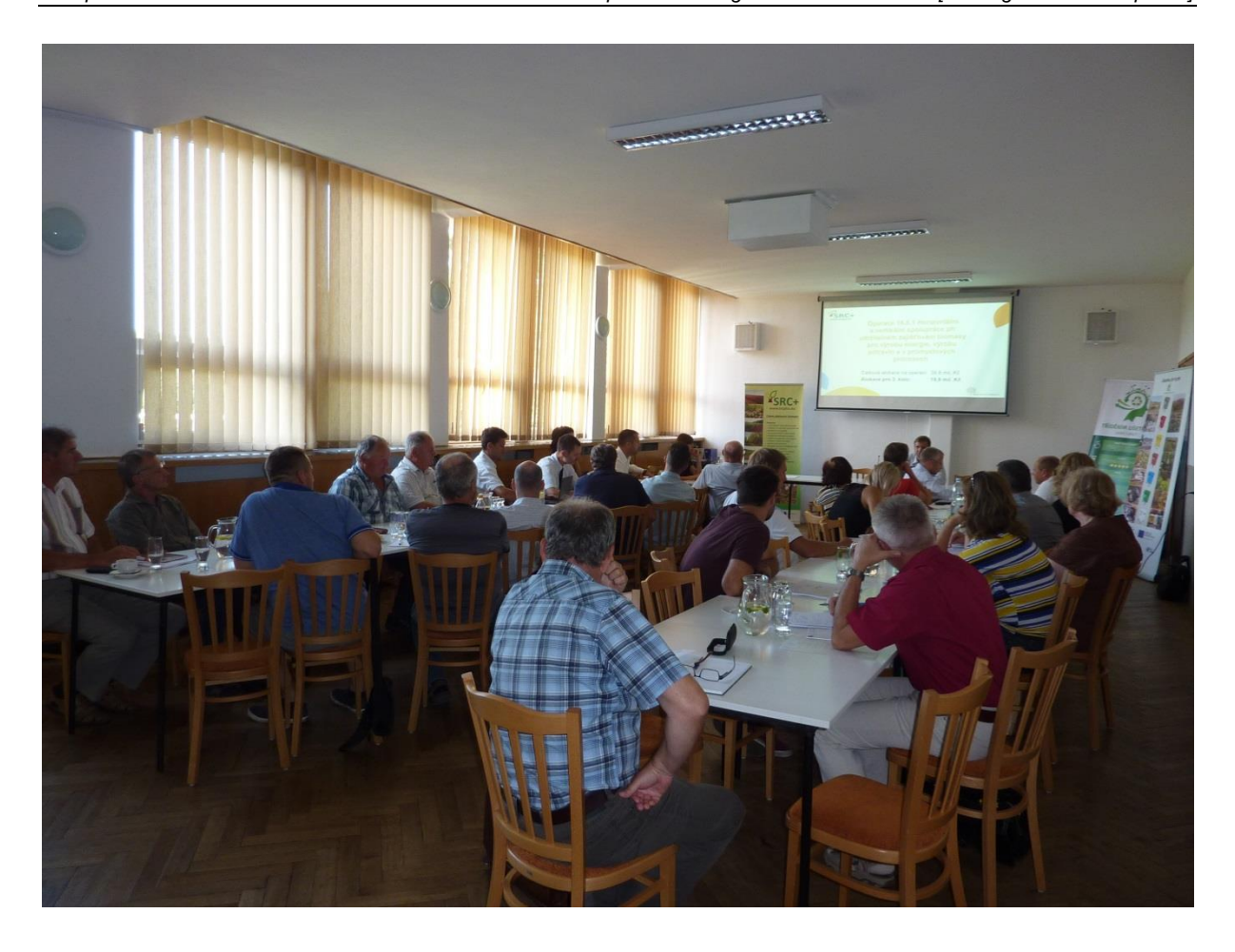
3.6 Others (media reports: newspapers, web page)

EAZK web page: <a href="http://www.eazk.cz/druhy-seminar-pro-zemedelce-v-ramci-projektu-srcplus/">http://www.eazk.cz/druhy-seminar-pro-zemedelce-v-ramci-projektu-srcplus/</a> SRCplus facebook page