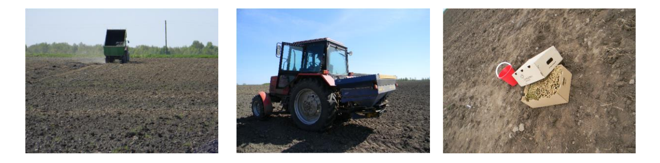
Figure 5: Establishment of Skriveri experimental field

Presentation also included practical information about Skriveri experimental field establishment, fertilization methods and harvesting. Videos and photos from establishment were shown in the end of presentation.