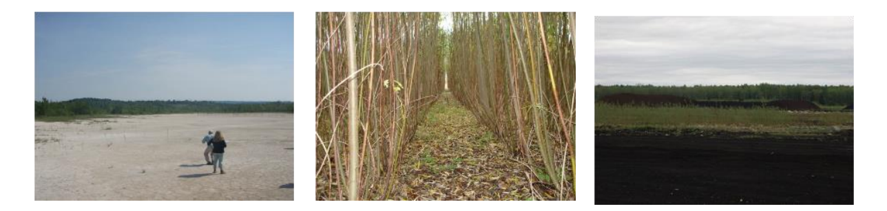
Figure 4: Different planting areas for SRC plantations

Plantation could help to manage high groundwater level where it is necessary or could be used in water treatment fields. Harvesting methods differs from species and soils conditions. On wet soils harvesting is recommended during freezing period, to avoid soil damages.