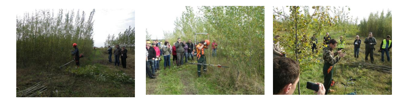
Figure 9: Plantation harvesting with different hand tools