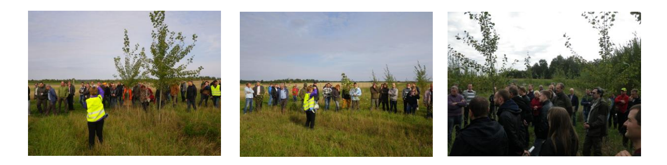
Figure 6: Skriveri experimental field visit

Seminar visitors were shortly introduced with Skriveri experimental field and history. Different tree species growing (hybrid aspen, poplar, grey alder, black alder, willows) conditions were discussed. Different clone and density hybrid aspen plantations were visited. Different poplar clones were compared and practical tips were given from previous experiments. Poplar clone difference was clearly visible and gives an insight about proper planting material choice. Different willow clone comparison sites were shown and practical experience was shared.