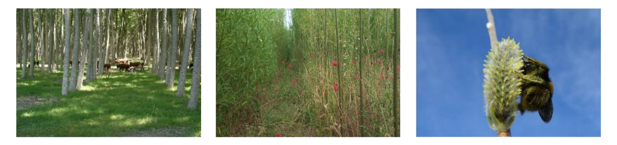
Figure 3: Using SRC plantation in different ways

Some animals use young shoots as food base and could damage or completely destroy new plantation, therefore fence or other defensive materials are recommended for protection. Rodents also could be dangerous for young tree stems and roots, therefore moving and other agro-technical operations will ensure better conditions for new trees. During blossoming season plantation could be used for honey producing by placing bee houses next to plantation.