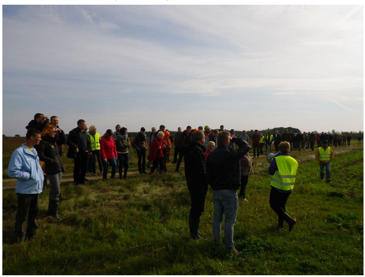
Figure 1: Participants of the SRC best practice visit in Latvia

Second part of the seminar was held in Skriveri experimental field, where existing poplar, willow, alder (grey and black), aspen, wild cherry and perennial energy grasses plantations were visited. Practical field demonstrations included demonstration of mechanized planting, small-scale manual harvesting and chipping.